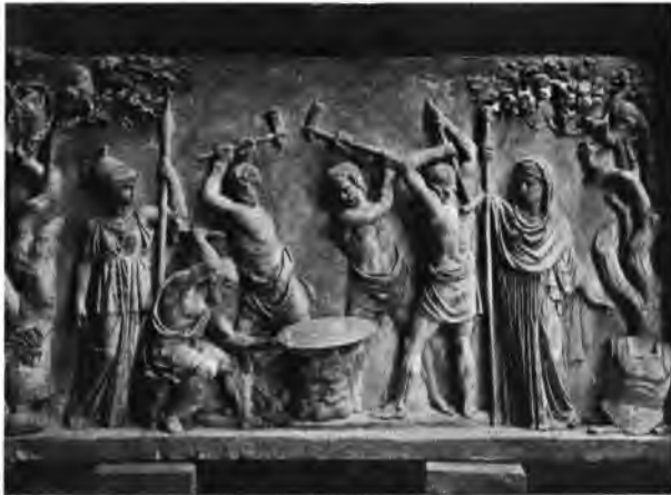
Fig. 13. Hephæstus and the Cyclopes preparing the shield of Achilles.

Hephæstus made the glorious palaces of the gods on Olympus; he made the scepter of Zeus